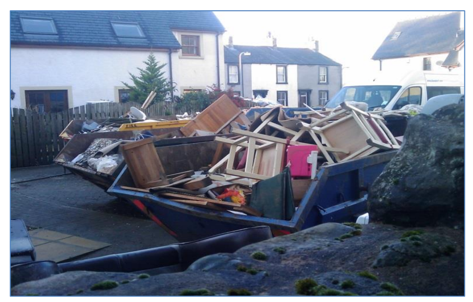
Figure 1 Cockermouth, Cumbria

"I have been informed of your support for Sefton Council and other local agencies during their work on the Bootle Flash Floods. Your knowledge, flexibility and experience proved invaluable in guiding us to a systematic and informed reaction to what was a unique event for us. We were especially appreciative, of how quickly you responded and your preparedness to 'pitch in' with the Drop-In Centre."