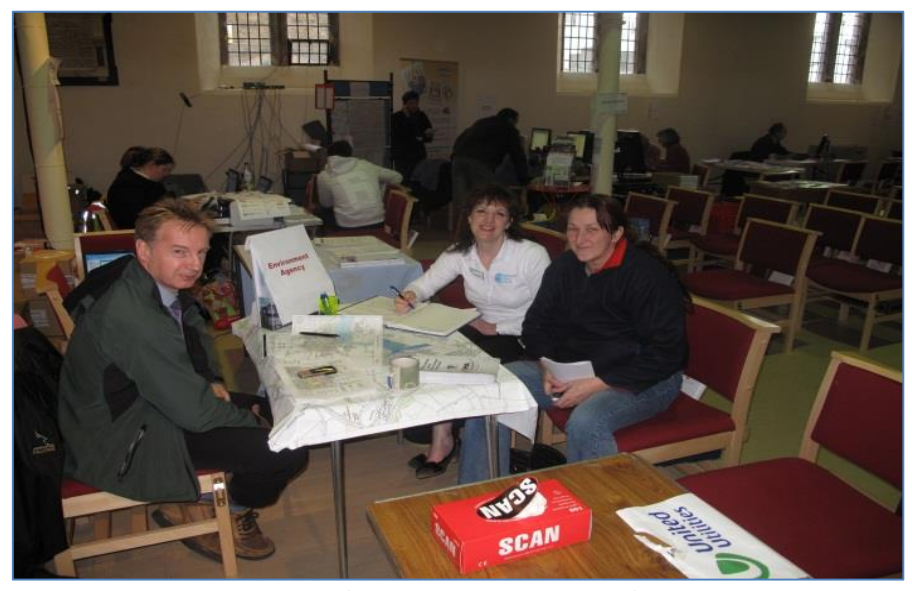
Figure 2 Cumbria support centre

Establishing links with the community enables them to keep those involved in the recovery process constantly appraised on people's activities and feelings on the ground.