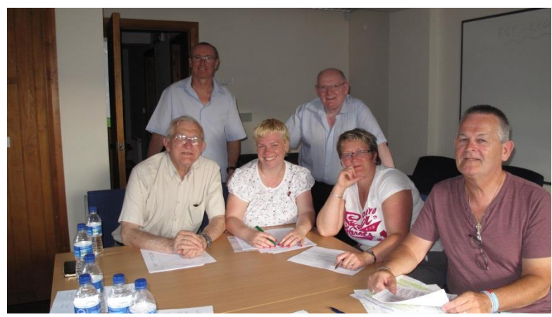
Figure 8 Todmorden Flood Action Group, Calderdale