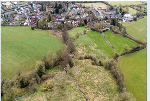
Fillongley Castle – downstream

When compared with footage of the same locations about 10 days apart it is clear to see the volume of water that makes its way to the village.