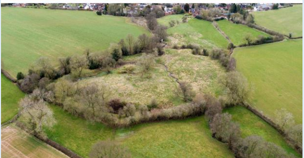
Fillongley Castle overview