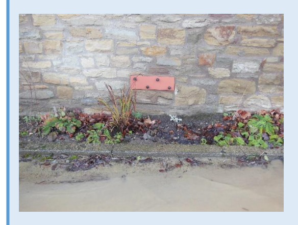
Air brick covers