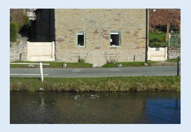
Flood gates and waterproof rendering

If, despite all the above, water overspills stream banks and flooding results, the onus is on the property owners to protect their properties. The Shropshire Council will on request send out a survey team to assess your property and make recommendations on how best to protect it. Grants are available for some items such as flood gates and waterproof rendering and sand bags are generally available locally on request to the Shropshire Council. There are depth gauges installed on the Diddlebury and Culmington Bridges and when flow levels reach a pre-set alarm level, a message is sent out to the local FAG. If the flow continues to rise and triggers a second higher alarm level (which has been set at a level known by experience to cause flooding), a further message is sent and the FAG can alert those vulnerable properties identified on their Flood Resilience Plan to give them time to erect their defences.